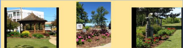
Some of our Gardens...

The purchase of a brick on the Patron's Path not only memorializes loved ones, but generously contributes to the maintenance of the Elk Rapids Garden Club's beautiful village gardens, allowing volunteer Club members to do their garden magic! The Patron's Path is located in the Pedestrian Bridge Garden .